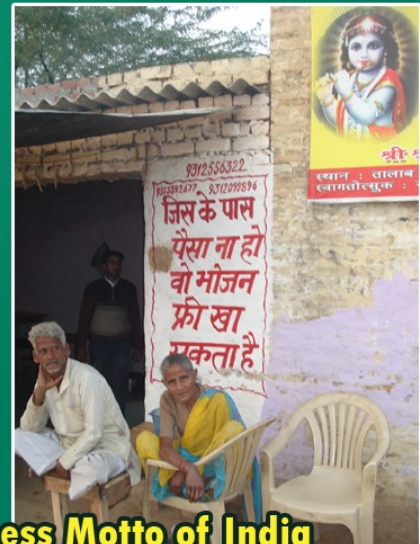
Demonstrating Traditional Business Motto of India - A Dhaba in Village Bhopani, Haryana.