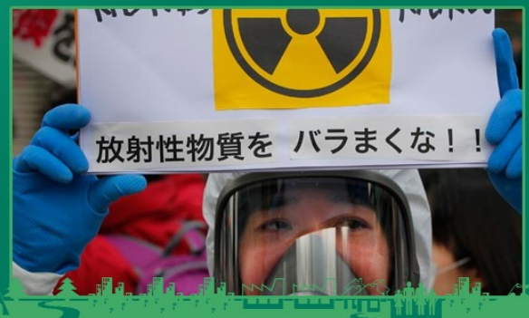
A protester holds a placard during an Anti Nuclear Rally in Tokyo on 27.03.2011